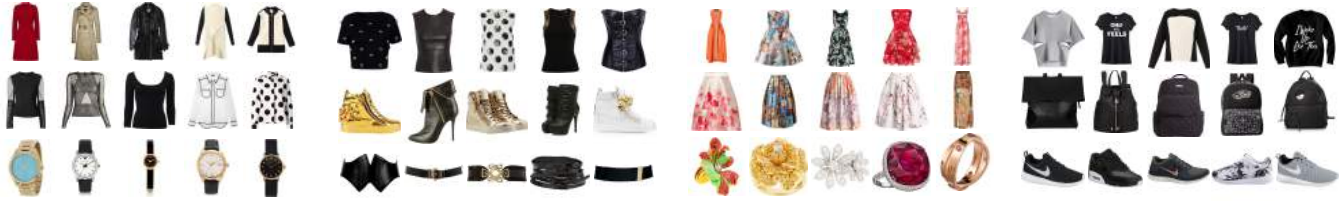
Figure 1: An automated personal stylist taking descriptions of outfit needs in natural language as input to produce item recommendations.

“ I need some clothes for a yoga retreat I’m doing next month. We’ll be up in the mountains in Colorado, enjoying the calming natural beauty. It is so beautiful up there in nature... and we’ll be running, doing yoga all day, sweating and finding zen... ”